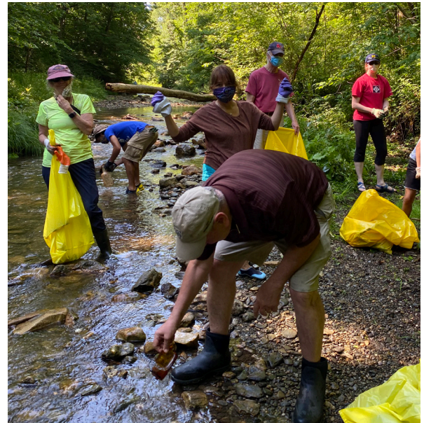
Photo from Green River Cleanup 2020

If you're able bodied and not afraid of slipping on wet stones, join us for a cleanup walk along the Green River. This is a project we've done in in collaboration with the Hoosic River Watershed Association for the last few years to address the debris washing into the river from a former town landfill located behind the Hart farm on